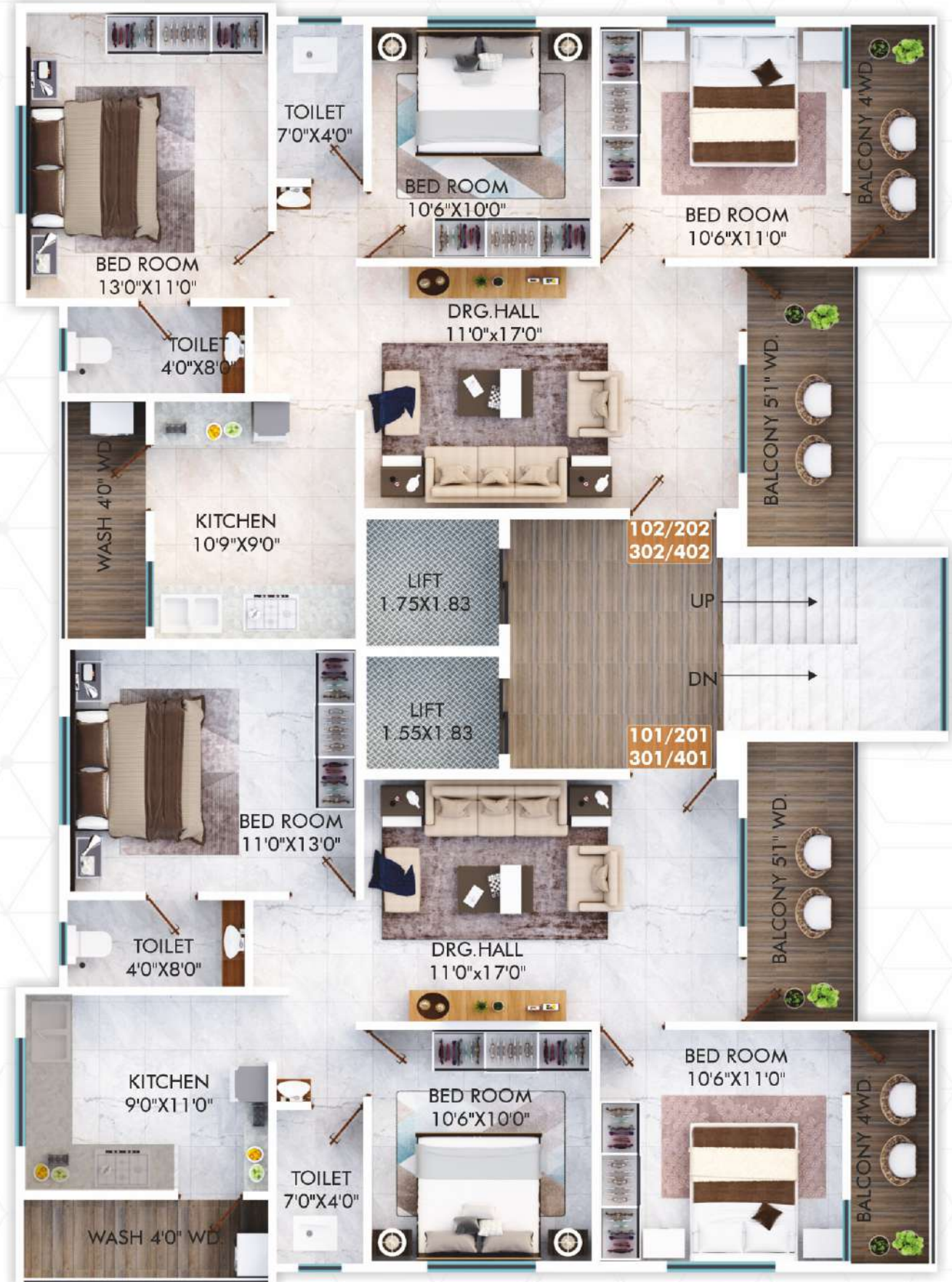
1ST, 2ND, 3RD, & 4TH FLOOR PLAN