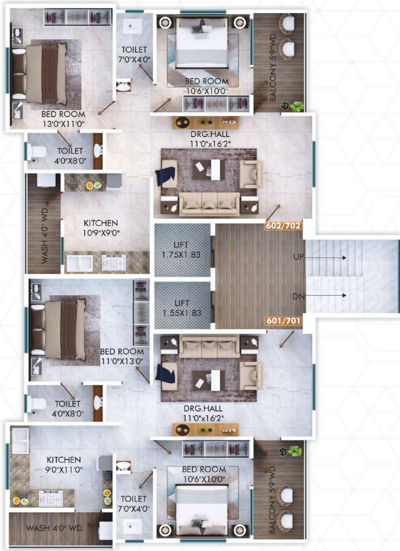
6TH & 7TH FLOOR PLAN