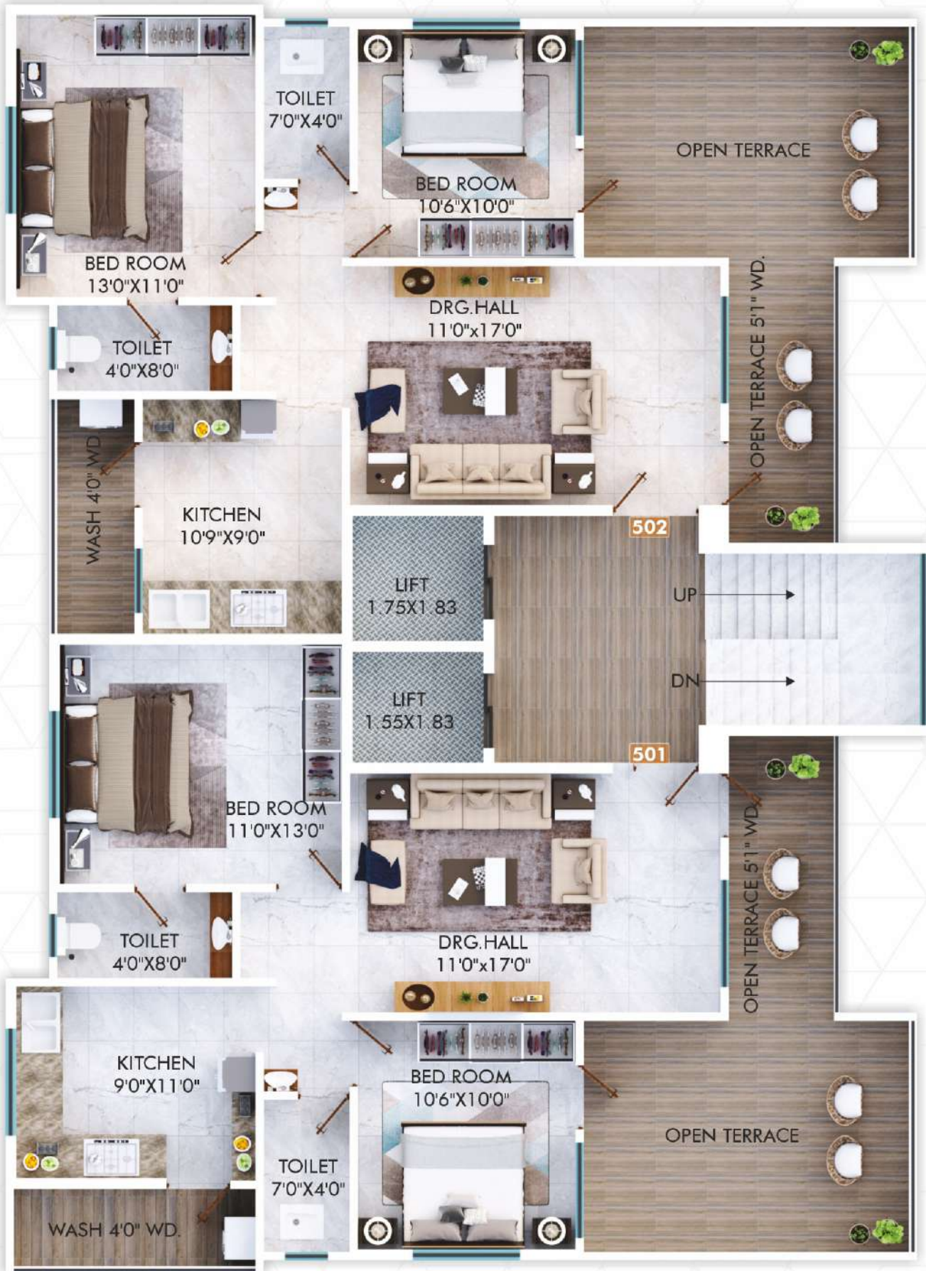
5TH FLOOR PLAN